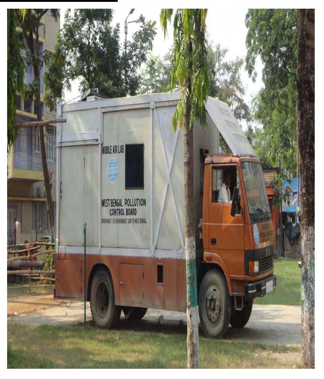
FD BLOCK, SALT LAKE